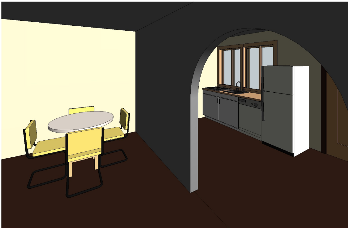
① 3D View 2